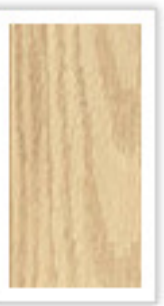
Pickled Oak 260