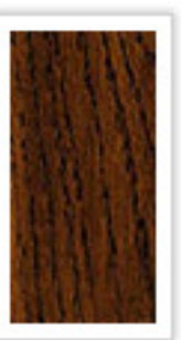
Dark Walnut 2716