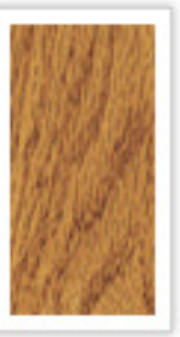
Golden Pecan 245