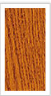
Colonial Maple 223