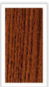
Red Oak 215