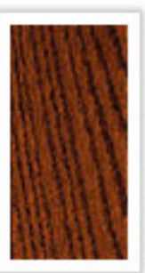
English Chestnut 233