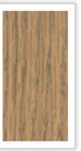
Weathered Oak 270