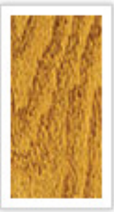
Ipswich Pine 221