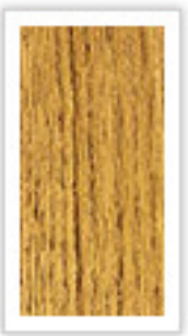
Golden Oak 210B