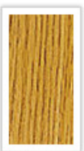
Puritan Pine 218