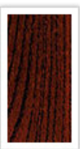
Red Mahogany 225