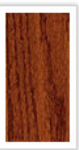
Red Chestnut 232