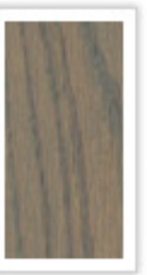
Classic Gray 271