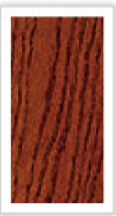
Sedona Red 222