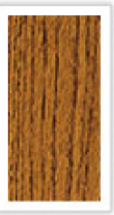
Early American 230